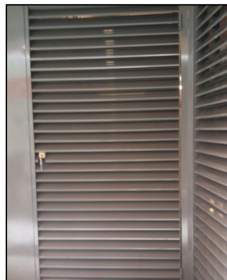
Bin Store Louvre Door and Side Panel