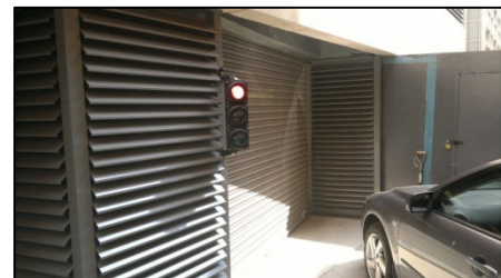
Approaching the Car Lift