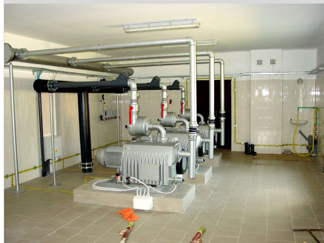
630 m 3 /hr Vacuum Pumps inside Nadarzyn Vacuum Station