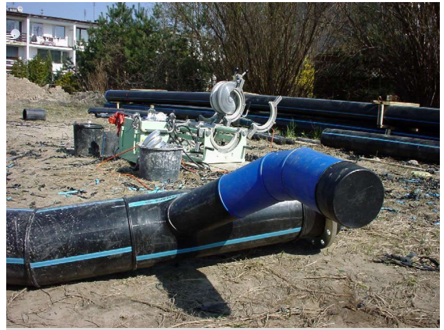
Fabrication of sewer junction