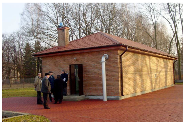
Outside view of Nadarzyn Vacuum Station

Steel cylindrical 16m 3 vacuum vessel, vertically mounted underground on a concrete base.