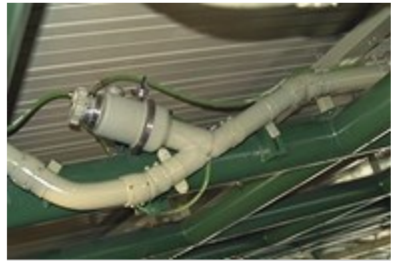
Vacuum Interface Valve suspended in roof