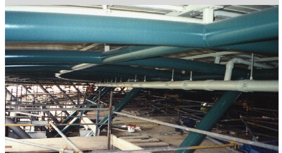
Vacuum Ring Main suspended from roof structure