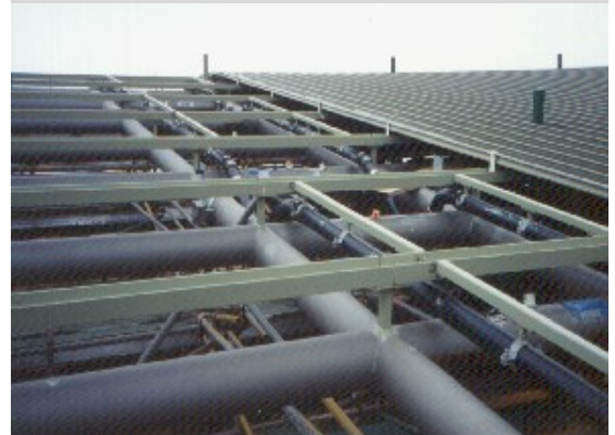
Black PE Vacuum pipe visible in roof prior to cladding