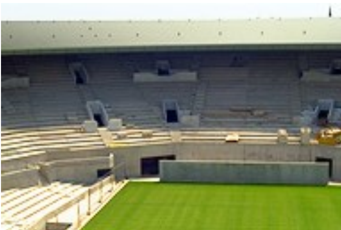
No. 1 Court under construction

The Interface Valves open and close automatically as the flow dictates and are switched off during play on the court, thus ensuring complete silence for the players. The complete system is constantly scrutinised via an Iseki valve monitoring system to check that valves and equipment are working fully and efficiently during the championships and automatically for the rest of the year.