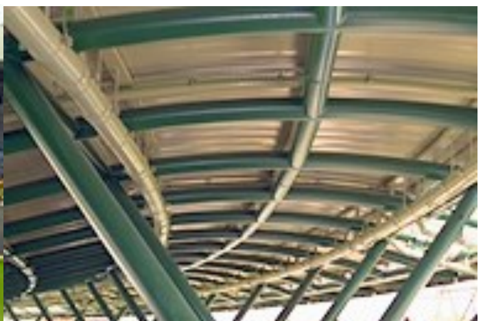
Vacuum ring mains